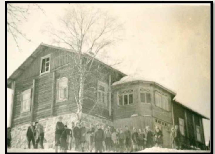
Teuvo taught in this house